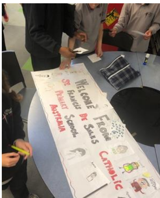
The students created a Friendship Banner to send to a school in the Ermera district.